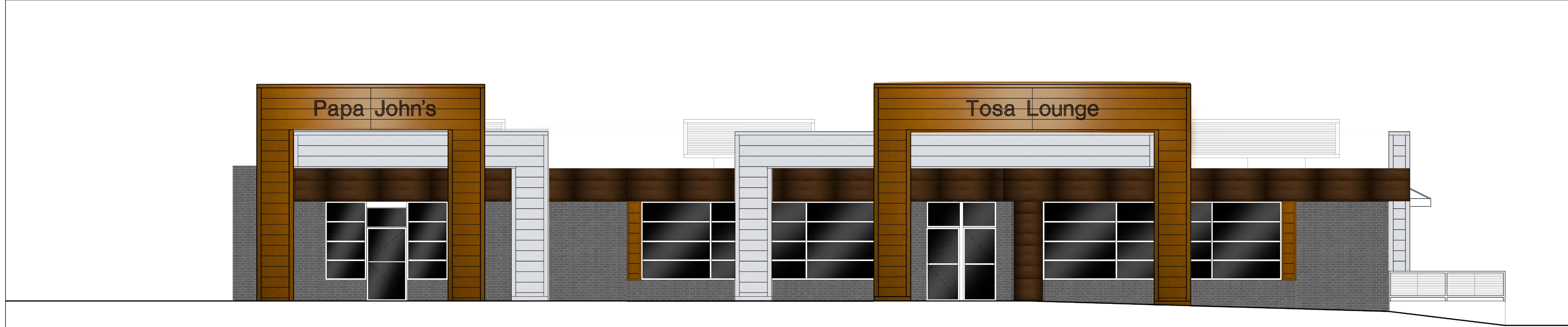
PROPOSED SOUTH ELEVATION 3/16" = 1' - 0"