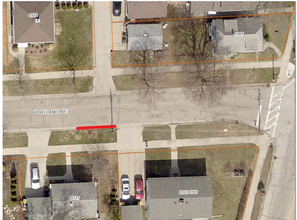
8121 W. Portland Avenue