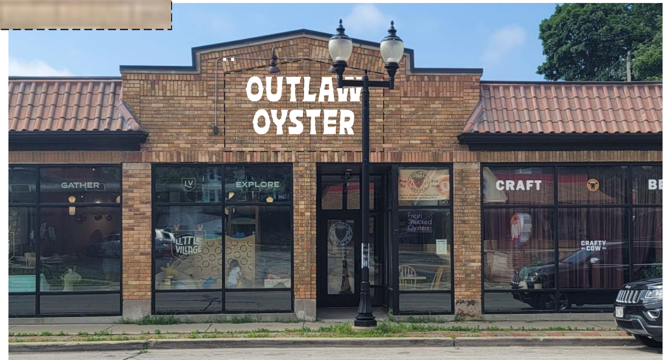
FRONT VIEW 1" = 1' - 0" Scale

SignEffectz, Inc SIGN / LIGHTING www.signeffectz.com