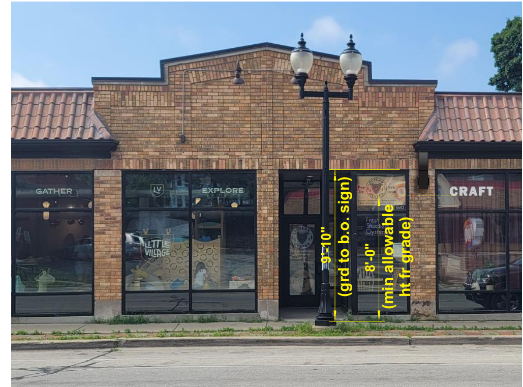
Projecting sign placement