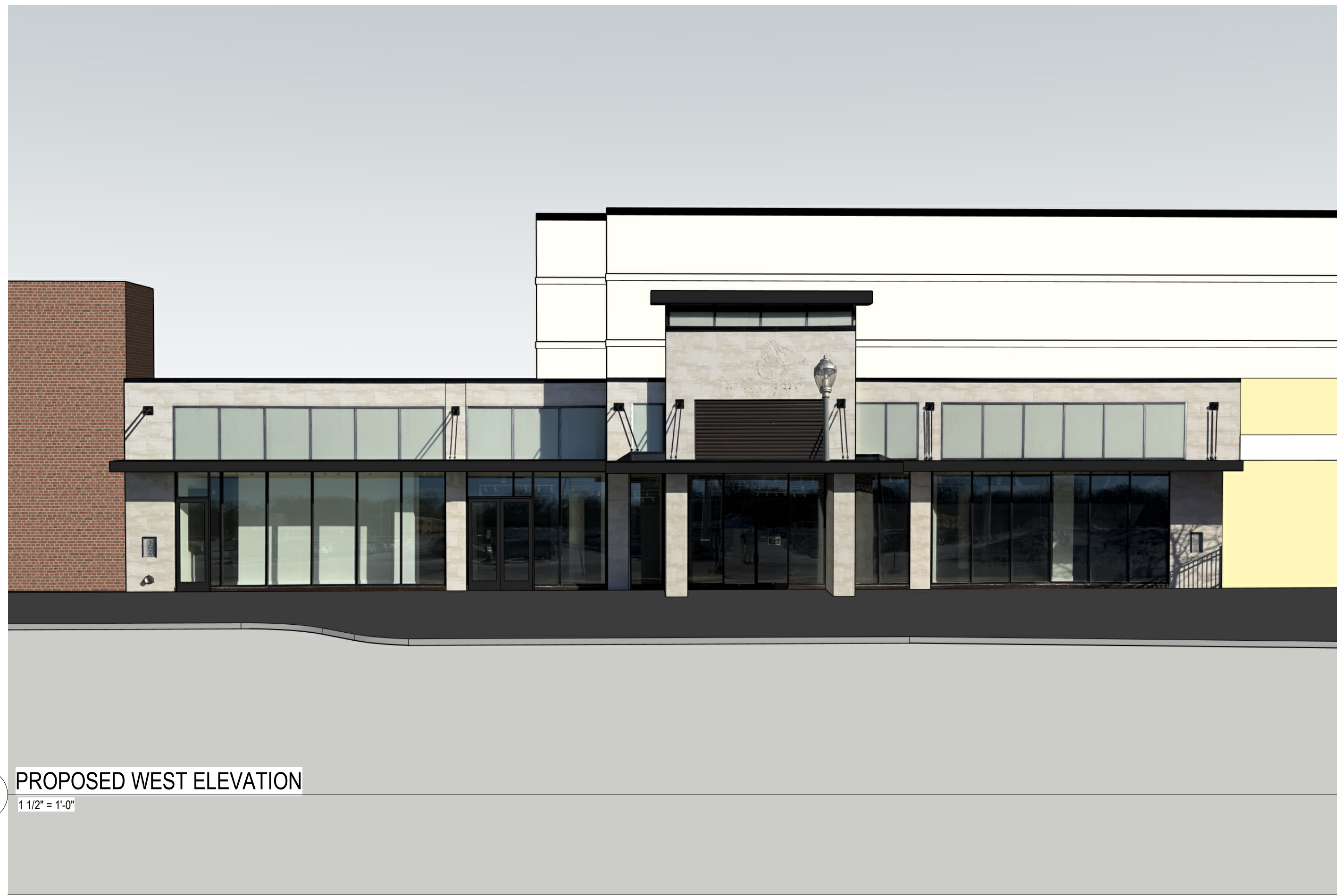
3 PROPOSED WEST ELEVATION 1 1/2" = 1'-0"