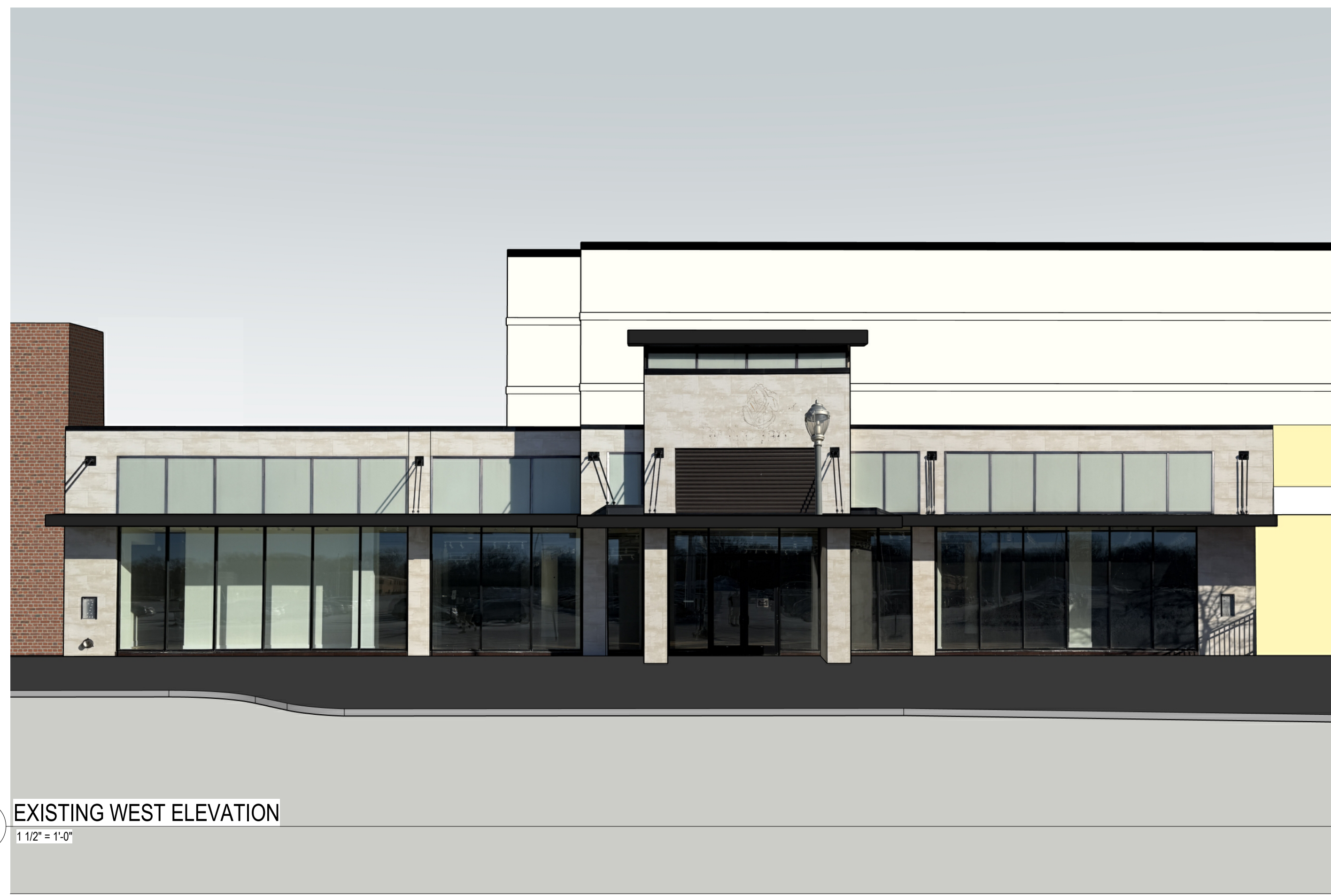
1 EXISTING WEST ELEVATION 1 1/2" = 1'-0"