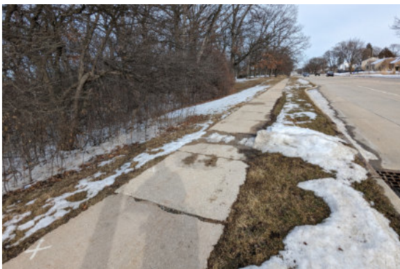
View east on Wisconsin Ave. Typical existing condition with 5' sidewalk and grass terrace. Terrace varies along corridor.