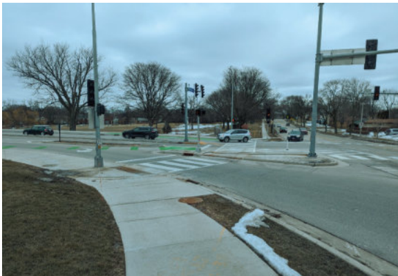
View east at the intersection with 87 th Street.