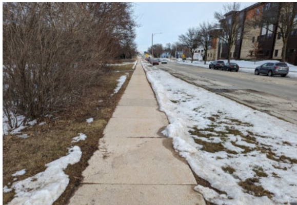
View east on Wisconsin Avenue.