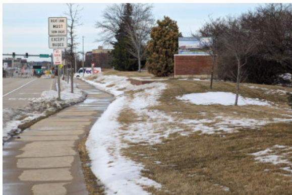
View north on Mayfair Road.