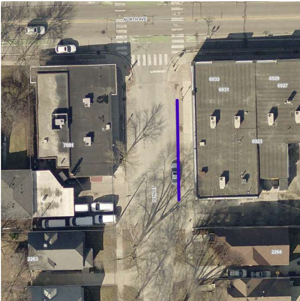
Approximate Location of Proposed Parking Trial

Direct staff to initiate a 90-day trial of 15-minute parking restrictions on the east side of 70 th Street from North Avenue to the alley south of North Avenue.