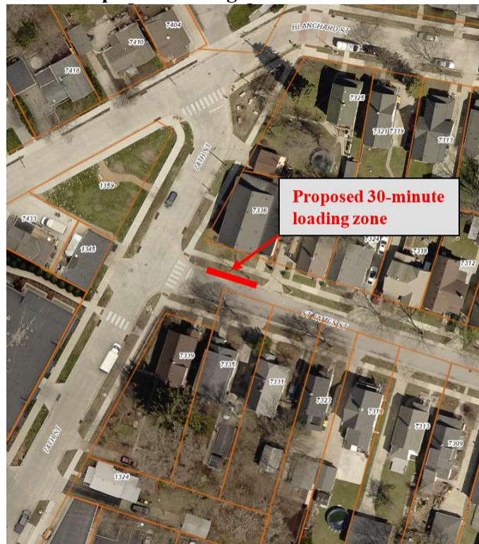
Exhibit: Proposed Loading Zone on St. James Street

Direct staff to prepare ordinance for introduction to Council for a 30-minute loading zone from 5 p.m. to 11 p.m. on weekdays and from 11 a.m. to 11 p.m. on Saturdays on the north side of St. James Street from 30-feet east of 74 th Street to 75-feet east of 74 th Street