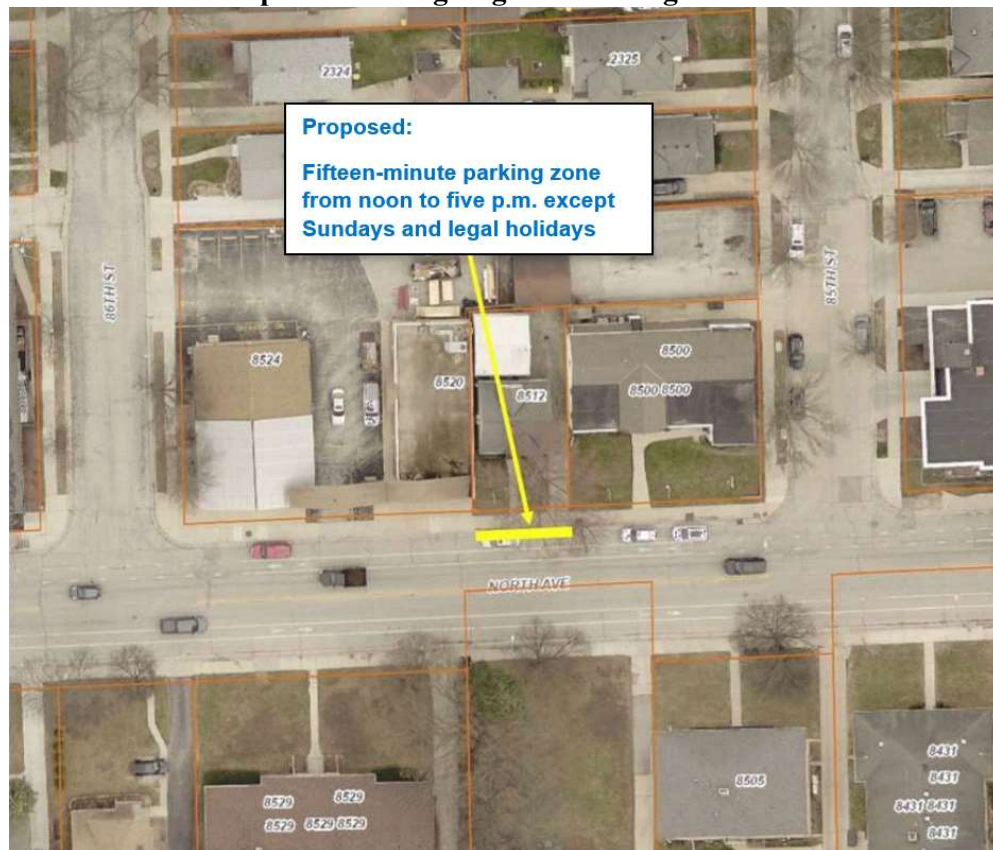
Exhibit: Proposed Parking Regulation along North Avenue

Direct staff to prepare an ordinance for a fifteen-minute parking zone from noon to five p.m. except Sundays and legal holidays on the north side of North Avenue from 90-feet west of 85th Street to 130-feet west of 85th Street.