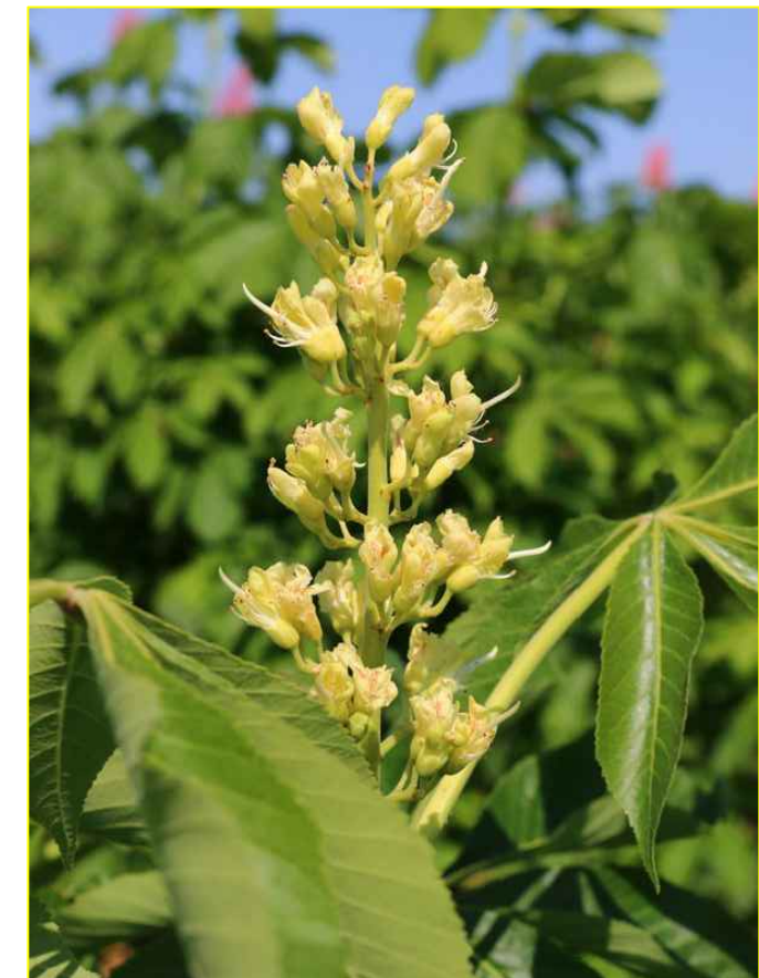
AESCULUS GLABRA 'JN SELECT' EARLY GLOW BUCKEYE