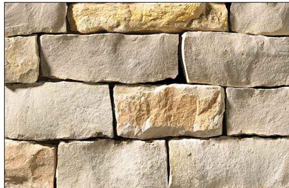
EXAMPLE OF STONE VENEER (HALQUIST 'FOREST')