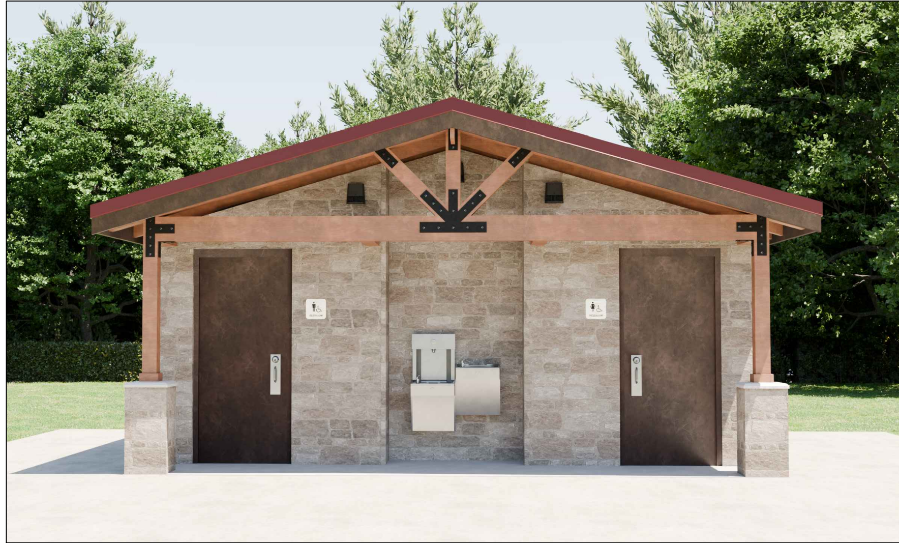
RENDERING OF PROPOSED RESTROOM BUILDING