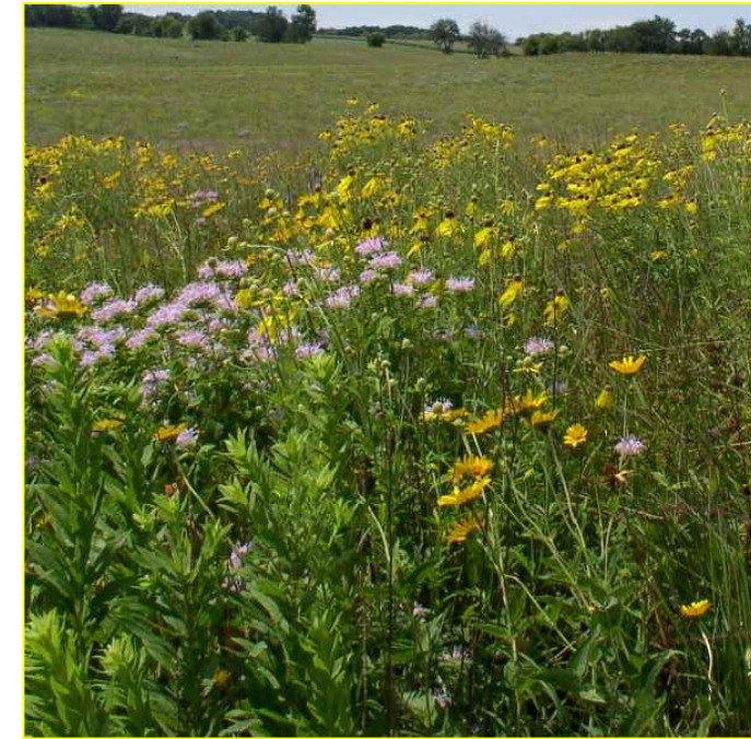
EXAMPLE OF NATIVE VEGETATED MAT