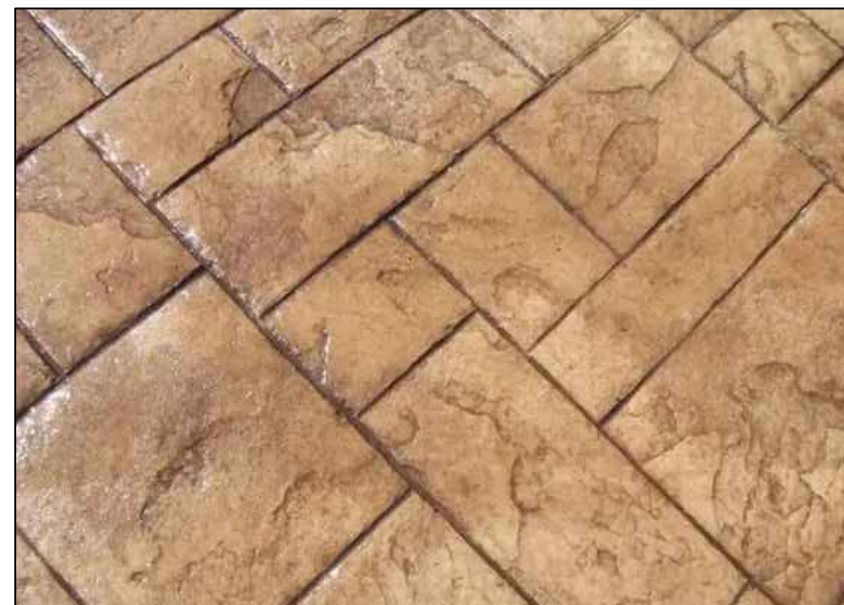
EXAMPLE OF DECORATIVE CONCRETE BORDER