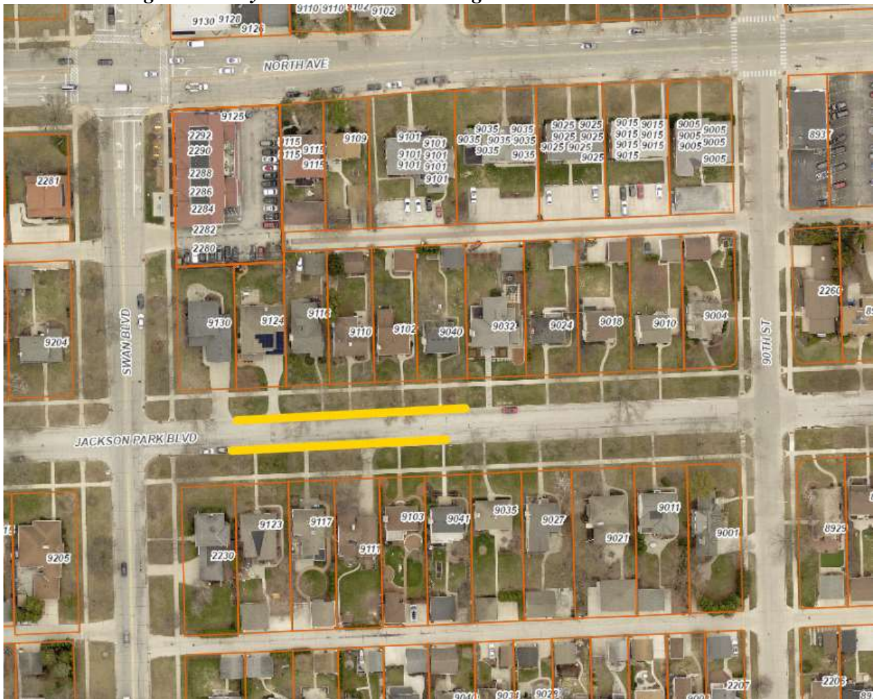
Figure: 90-Day Trial to Remove Parking Restrictions Shown Below

Direct staff to initiate a 90-day trial to remove parking restrictions on Jackson Park Boulevard east of Swan Boulevard