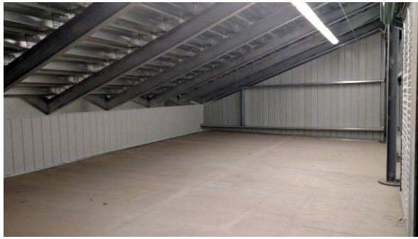
Figure 2 Wauwatosa West Inside Enclosure

not to exceed $175,000 and waiving of the request for proposal process. The proposed base price of $168,100 is for the installation of 6 storage areas under the West side spectator seating area totaling 3,709 sq. feet of usable storage space. Each individual storage unit would be less than 1,000 sq. feet, per building code, and would include an over-head door for access. The proposal from JWI also includes the option to add a service door to each of the storage units at a cost of $1,400 per door. Staff intends to work with community stakeholders to evaluate which units, if any, would benefit from the addition of a service door.