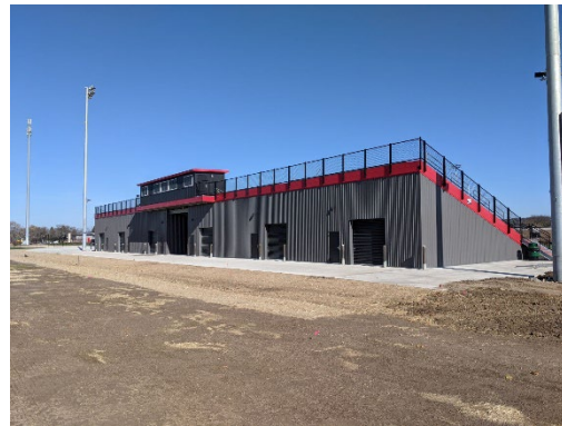
Figure 3 Sauk Prairie Enclosure