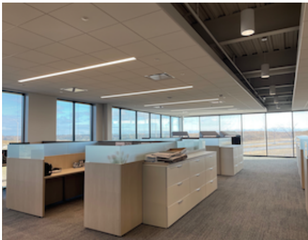
1st floor - Irgens space